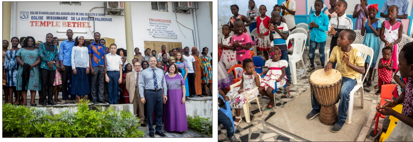
Bethel Assembly of God - Church plant started in fall 2017

Our church plant, Bethel Assembly of God in Abidjan, continues to grow monthly. We have added an area for our children and are now praying for land to place a tabernacle in 2019. We are out of room! Tim has also held over 25 revival and evangelism meetings with other churches across the nation since September.