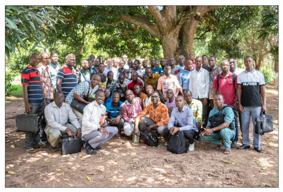
Thank you, North Texas District Men's Ministry, for the Light for the Lost funds that have made this launch possible!