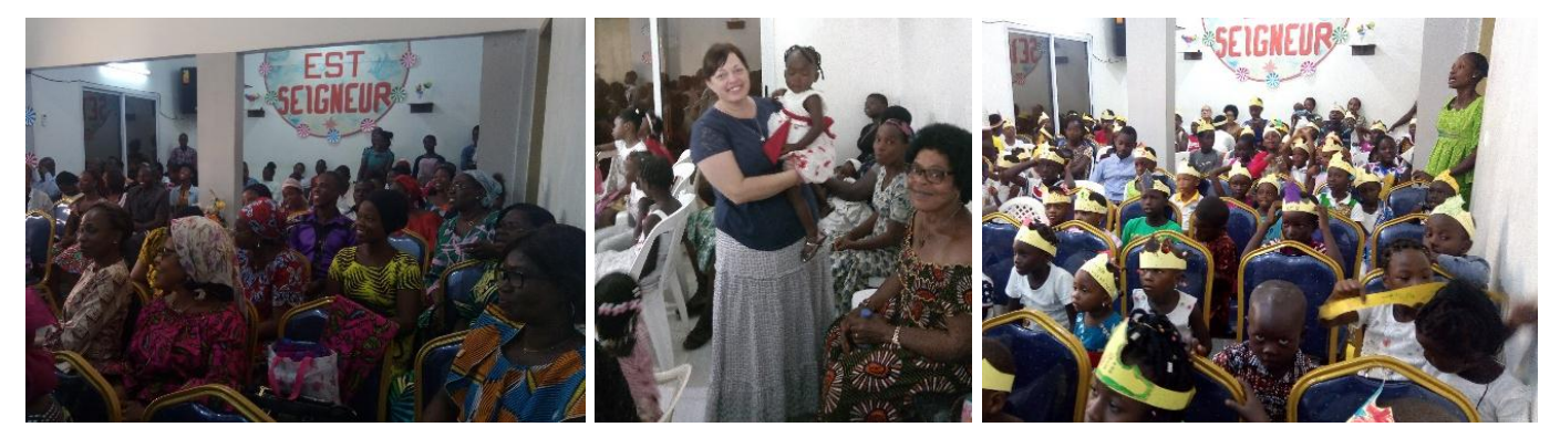
Urgent prayer need! Over 200 adults and 50 children are in weekly attendance. Despite 60% unemployment, our members have saved $5,000. We have a tabernacle ready to build, but we need $50,000 to buy land . Please contact us if you or your church can help with this need. Thank you!

Our church plant, Bethel AG, has grown to over 200 members. We begin 2 services this week and need land!