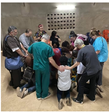
(Ministry Center - Triage and Pharmacy)